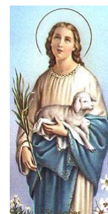
St. Agnes of Rome