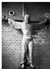
St. Paul Miki