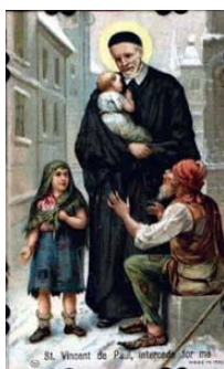
St. Vincent de Paul

How did these saints follow their call and respond to God?